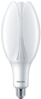
Trueforce E27 Others Frosted