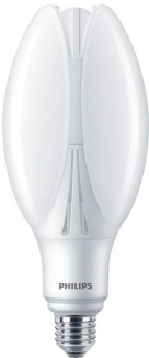
Trueforce E27 Others Frosted