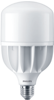
Trueforce E27 T-shape Frosted